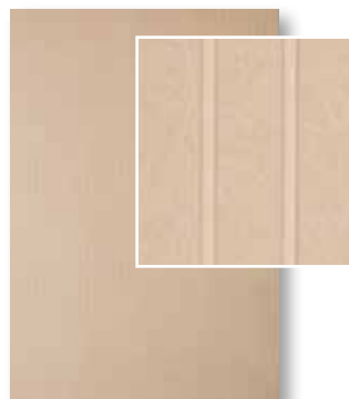
Unfinished 5.2mm MDF substrate