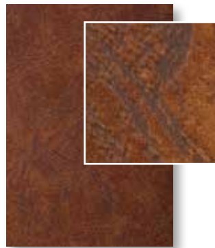
Coffee Bean Leather* 1/8" MDF substrate Paper Overlay