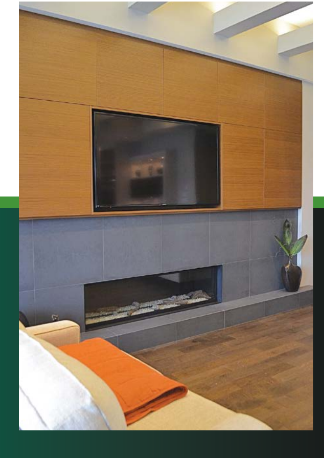
Teak Quartered UC3013