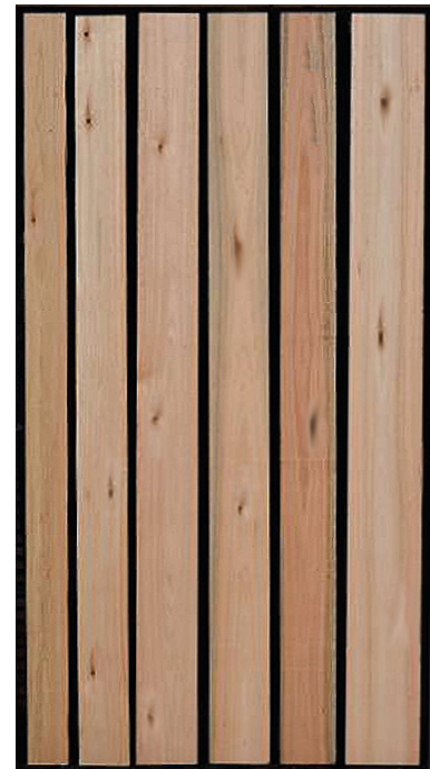
No 1 Common Face